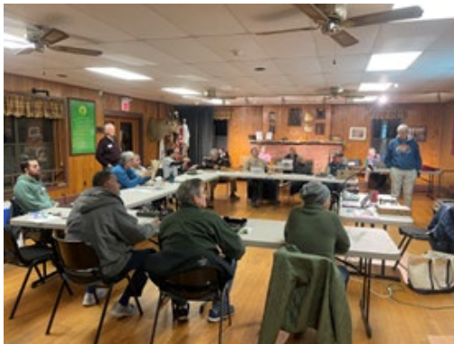
Look for an announcement for our 2024 classes later this year.