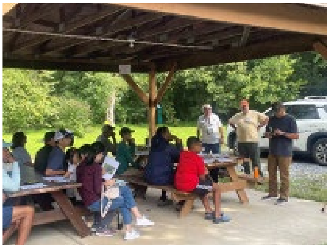
Students getting an introduction to spinning rods.

It was a great day with everyone enjoying the course, a great lunch, and the beautiful day.