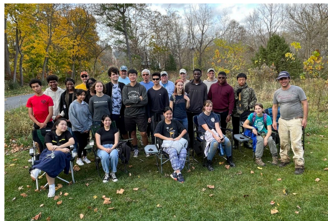
The workday crew!