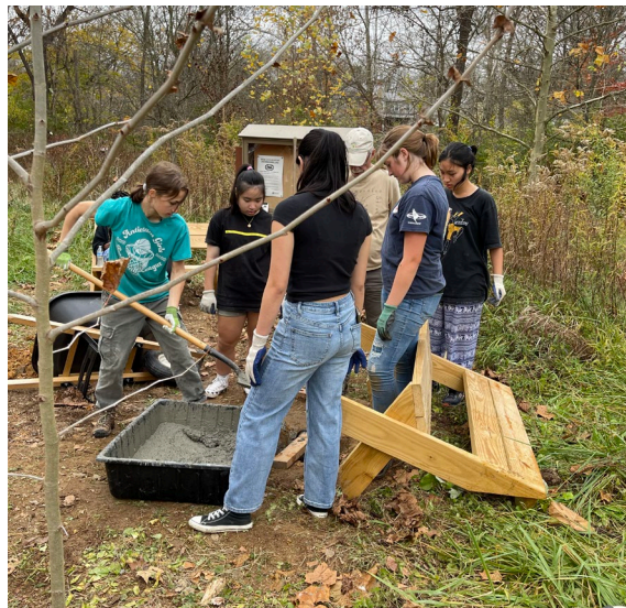
St. James students mixing concrete to anchor one of the benches at the fisherman's parking lot on Beaver Creek Church Road