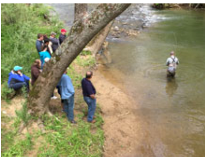
The stream technique instruction focuses on fly presentation and line management.

To ensure everyone had enough energy for the day’s tasks, the session started with a nice lunch of grilled burgers, chips, salads and desserts. After lunch, the students were divided into two groups and each group rotated through each “class” in the curriculum. The instruction was professional quality—normally costing hundreds of dollars for such a class—but SVTU believes that such classes are essential to develop interest in fly fishing and passing on the importance of ecological conservation, so they offer the class for free. Anyone that is interested in learning about fly fishing should consider joining the Seneca Valley Chapter of Trout Unlimited. Check the Seneca Valley TU website for more information and additional photos of the event.