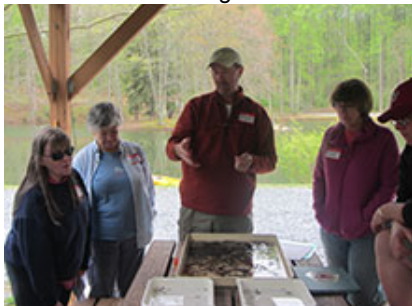
Macro invertebrate entomology uses “bugs” from a nearby stream and is linked to a display of the flies that mimic the developmental and adult insect stages.